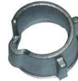
Forged Top Cup