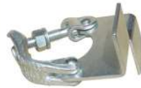
Board Retaining Coupler