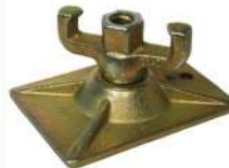
Plate With Nut