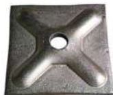
Ripped Counter Plate