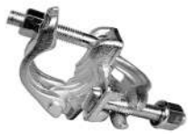
Right Angle Coupler